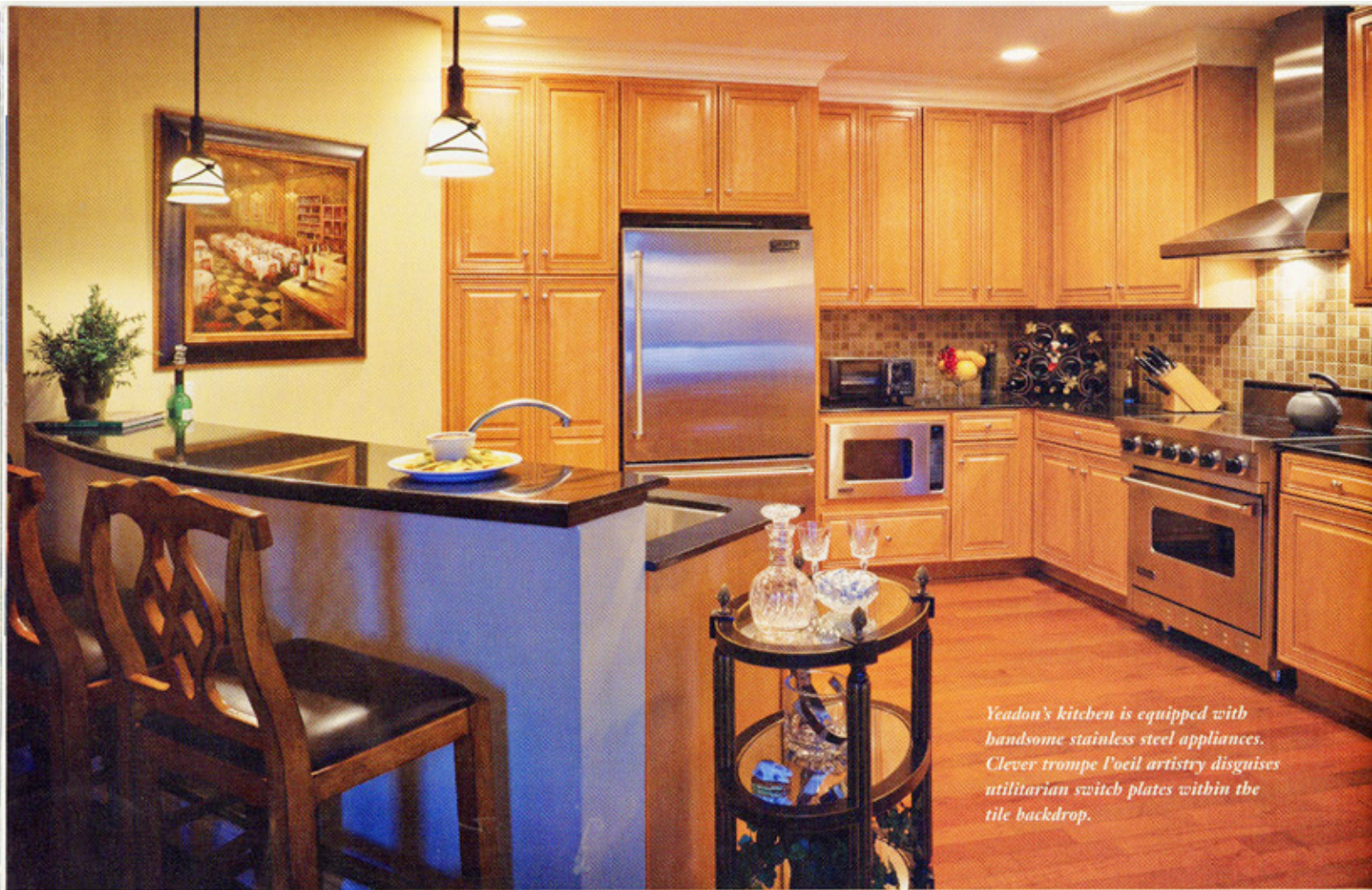
Yeadon's kitchen is equipped with handsome stainless steel appliances. Clever trompe l'oeil artistry disguises utilitarian switch plates within the tile backdrop.